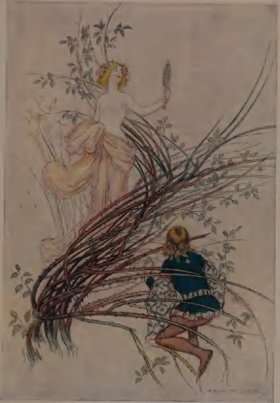
TO MERCILESS BEAUTY